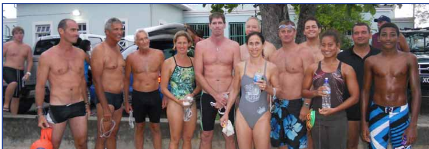
2013 Hometown Starters

For information on this event, please email us at flyingfishbim@yahoo.com .