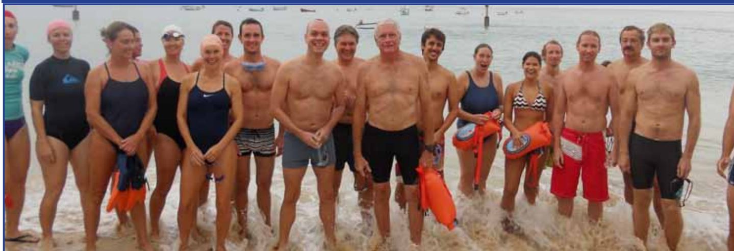
2013 Weston Starters